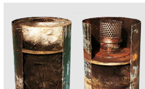
The glass fiber roving in these silencers, filled with the Owens Corning Silentex® noise control system, essentially is unaffected after six years and 270.000 km of service.

Additionally, the Advantex® glass composition has higher temperature capability and greater resistance to the corrosive gases present in the exhaust system than any basalt wool glass fibers or standard E-glass compositions.